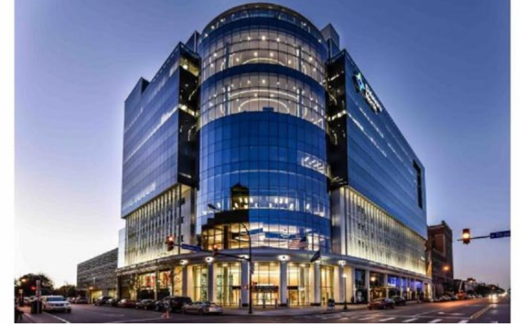
2017 Winners: SUNY Buffalo

The Third Annual Colvin Case Study Challenge will be held on Saturday , December 8th from 1:00 pm - 5:00 pm in Room 1111 of the Architecture Building at the University of Maryland , College Park . Four finalists teams from across the nation will be presenting this day to a panel of industry professionals. A reception will follow at The Hotel at The University of Maryland from 5:15 pm- 7:15 pm.