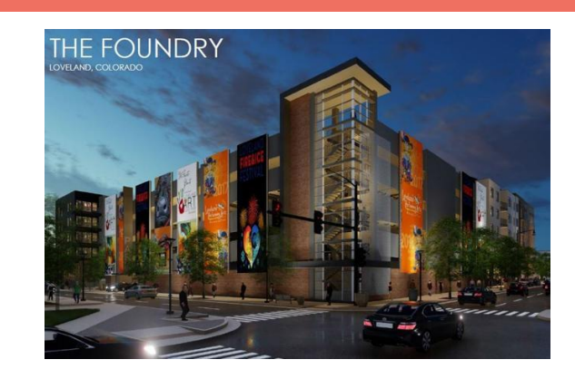
The Foundry Colorado State University, Winner 2019