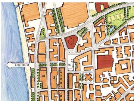
Images from top: Interior of LEAFHouse; LEAFHouse on the National Mall at the Solar Decathlon; student's design for a train station in Castellamare di Stabia, a project of the Urban Design Studio.